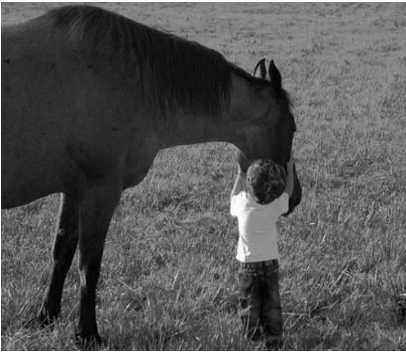
Have you hugged a horse today?

For more than 56 years the Michigan Quarter Horse Association has been a source of pride, membership and competition for equine enthusiasts throughout the world. The Michigan Quarter Horse Association (MQHA) and its members have brought Michigan to the forefront of equine competition and sportsmanship. MQHA not only provides an opportunity for Youth, Amateur and Open exhibitors to compete, but also has a level of excellence that drives these exhibitors to success throughout the country, and world.