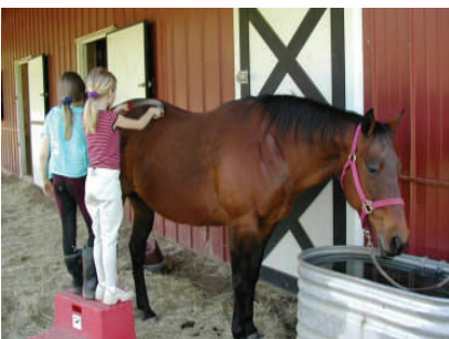
MQHA Youth Members getting ready for the big show.

The purpose of the MQHA Partnership Program is to promote those businesses and individuals that are supporting the longevity of MQHA through a financial commitment. We believe that members, parents, friends and family would prefer to conduct business with those companies and organizations that are supporting and promoting MQHA’s effort to create a solid future for the equine industry in Michigan.